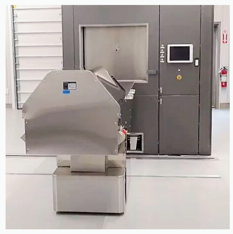
Pyrox 3000 - High-Capacity Cremation Retort

We are always looking for ways to better serve our clients. We are confident that this new and improved building and cremator will do just that.