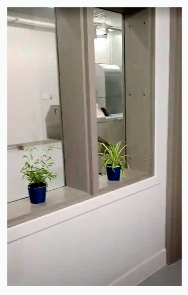
Family Viewing Room