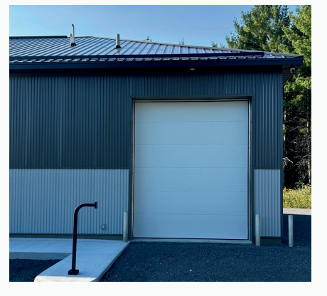
Card Tap to Garage for Drop Offs