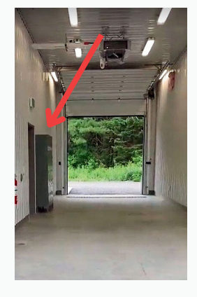
Individual Funeral Lockers