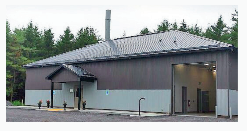
Drive in, Drop Off, Drive Out