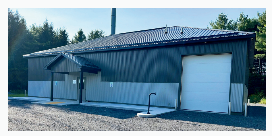
South Branch Crematorium - New Building, New Crematorium, New Winter Storage

The new crematorium has a number of new and improved features to better serve our clients, including more efficient drop off, after hours pick up of cremated remains and a viewing room for families. In addition, we have installed a locker for each funeral home.